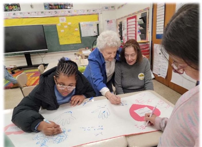
Right: Students and mentors making Valentine cards for Wilson Health Care residents and Gaithersburg Elementary teachers.

As we reflect on our journey, we are reminded of the profound impact small acts of kindness can have. From our hearts to yours , we hope to continue spreading love and positivity wherever we go. After all, it's simple gestures that have the power to touch lives and create lasting connections.