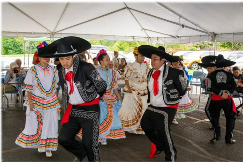
Left: Mexican folk-dance group, De Colores perform at GBCI's Community Day.