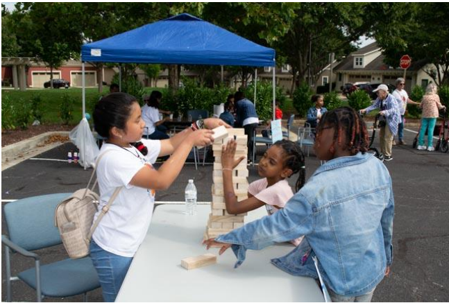
Above: Kids playing Jenga at GBCI's Community Day.

Watching families from different cultures share a meal, enjoy entertainment, and interact with one another reinforced the value of living in Gaithersburg, one of the most diverse cities in the U.S.. A resident at Asbury Methodist Village commented on the growth of GBCI's Community Day, saying "It was great to see the community participate, particularly the off-campus community, and to see the growth since last year"