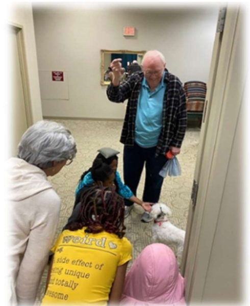
We were happy to have an AMV resident and his dog walk by Parker Hall—the students loved a surprise visit with a cute puppy!